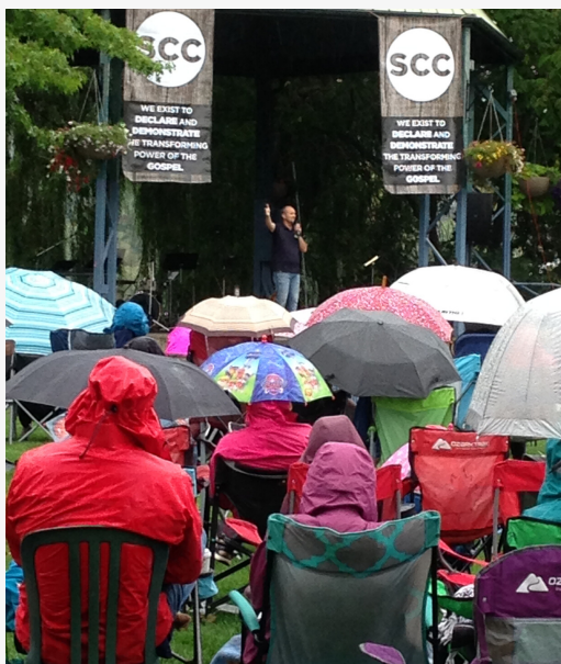
SCC Summit Service at the Wharf in Salmon Arm

Average weekly attendance increased by 9% in the last 12 weeks of 2019.