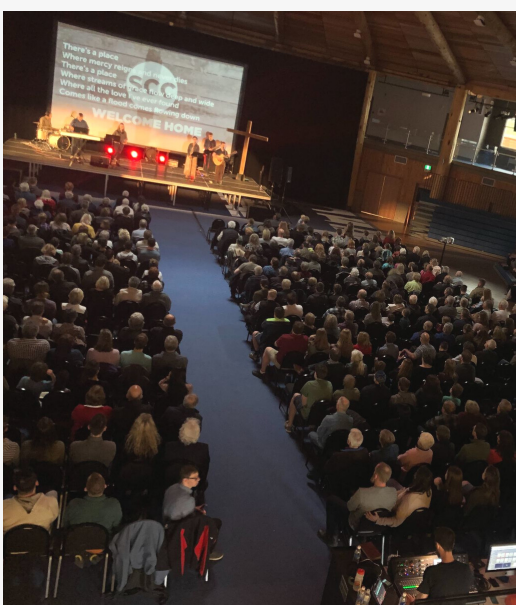
SCC Good Friday Service at the Splat sin Center